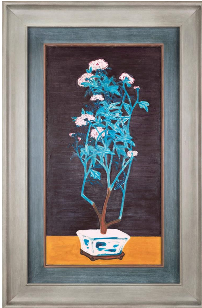
SANYU (CHANG YU, 1895-1966) Potted Chrysanthemums

The Latest Addition to a Formidable Line-up of Masterpieces Presented at Christie's this Spring